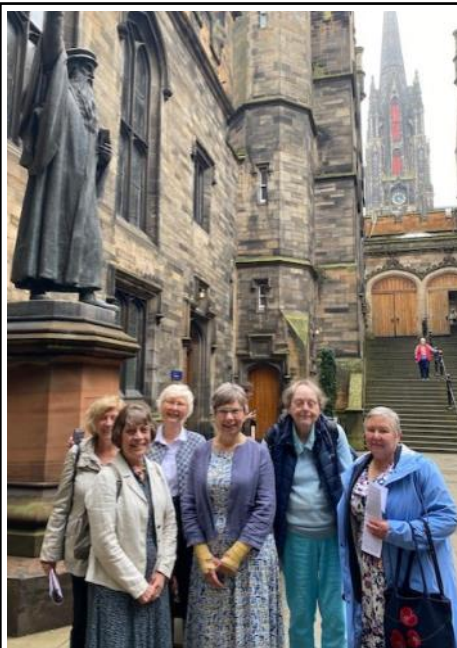
The Guild National Gathering 7th September 2024

Church lunches are a great way to get to know our church family better and also a safe place to invite friends and neighbours who don't come to church.