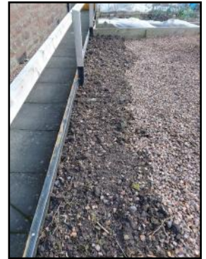
New wild flower strip

Communal Garden Over the last month we have been working with the PKC Biodiversity staff to improve the garden for wildlife. We plan to add more fruit trees, fruit bushes, plants for pollinators and create a Potager garden, another take on how you can garden for the kitchen and nature. All of the materials will be provided by or funded by PKC along with bat/bird boxes, bug hotels and hedgehog houses. If anyone is particularly interested in this aspect of gardening please get in touch, its going to be a really rewarding time.