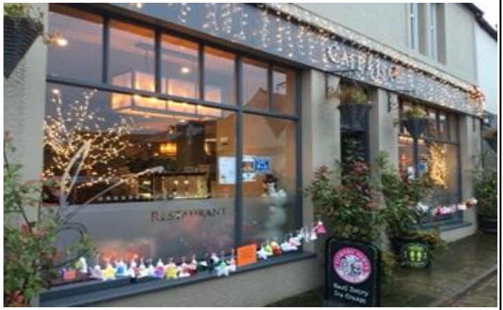
Angels - December 2020

A huge thank you to all who have made angels and a gentle reminder to put them in the box at the back of the Church no later than Sunday 8 th December. We have 600 tagged and ready to go out plus a huge bag of ones still to be tagged..... Thanks to Mandy for printing and laminating all the labels.